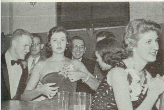
Caught in the act!